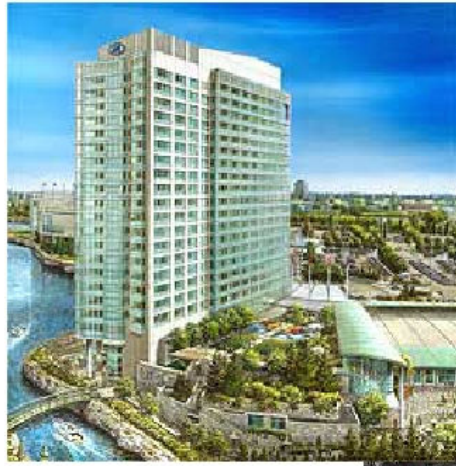
Above: Architect's rendering of finished project Right: Actual during-construction photo of the Casino De Hull, Quebec